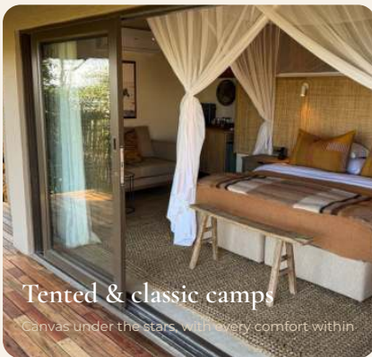
Tented & classic camps

Where you sleep shapes the whole trip. The right camp puts you in the best wildlife area, with guides who know the ground and a style that fits how you like to travel.