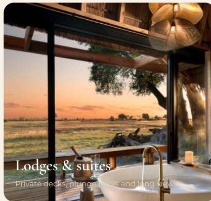
Lodges & suites

Canvas under the stars, with every comfort within